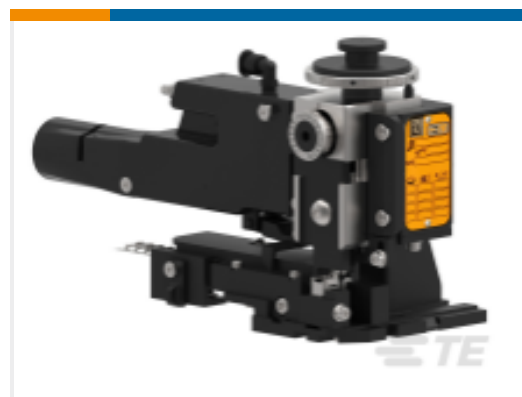
TE Part # 2151101-2 OCEAN_2.0_APPLICATIONER-S-090F120O