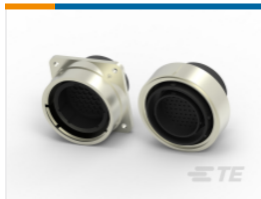
TE Part # CAT-AM71-C83998C Circular Plastic Connector, CMC Series 1