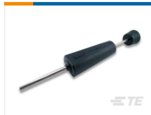
TE Part # 305183 EXTRACT TOOL TYPE 2 20-16