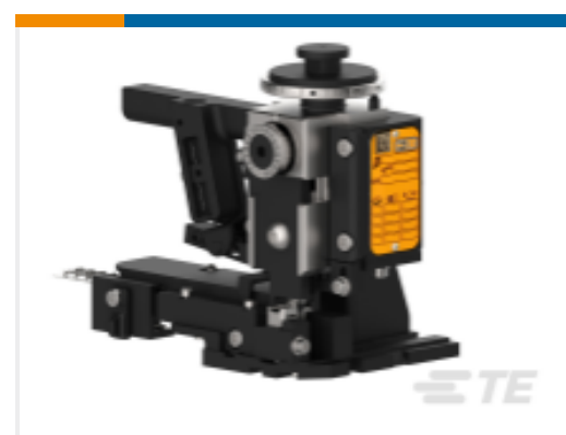
TE Part # 2151101-1 OCEAN_2.0_APPLICATIONER-S-090F120O