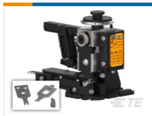
TE Part # 7-2151101-1 OCEAN_2.0_APPLICATIONER-S-090F120O