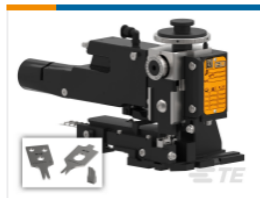
TE Part # 7-2151101-2 OCEAN_2.0_APPLICATIONER-S-090F120O