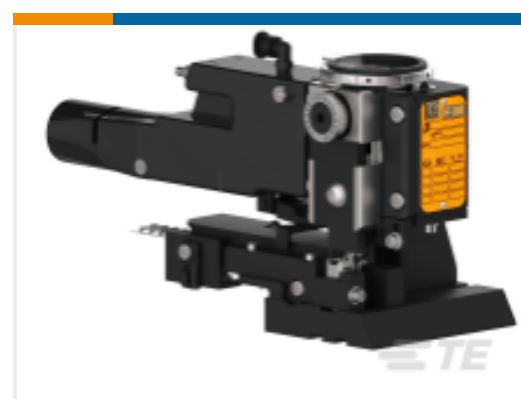
TE Part # 2-2151102-2 OCEAN_2.0_APPLICATIONER-S-046F059F