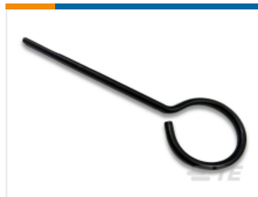
TE Part # 200893-2 INSERTION TOOL CONT