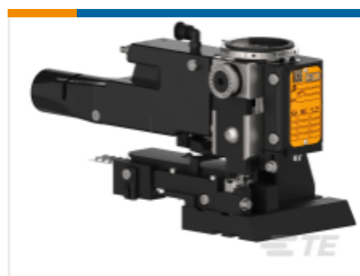
TE Part # 2-2151101-2 OCEAN_2.0_APPLICATIONER-S-090F120O