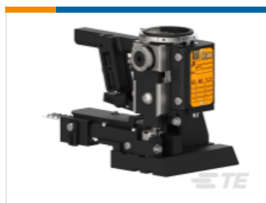
TE Part # 2-2151101-1 OCEAN_2.0_APPLICATIONER-S-090F120O