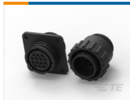
TE Part # CAT-AM71-C83998K Circular Connector, Environmentally Sealed, CPC Series 6